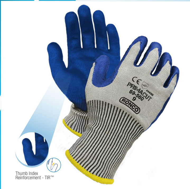
Thumb Index Reinforcement - TIR™

Super-Fit HPPE Gloves with Nitrile Palm Coating