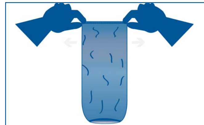
1. Pull elastic

Please ensure that this information is available to employees on the work floor.